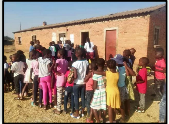
Rt. Community Hall Loaned out for the Church

Then, on the last week of every month we will have a get together Sunday at Rasper. They offered us a community hall to use. It's now 2 weeks since we started having services there.