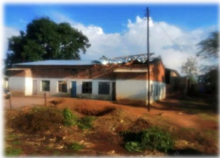
Grade 5 Classroom Cyclone Damage