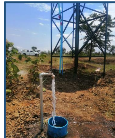
Rt. Precious Drinking Water