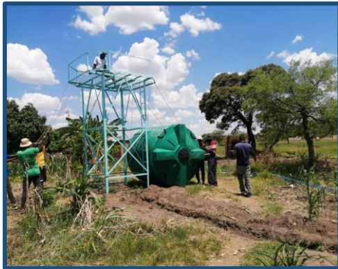
Lt. The Tank Arrives!

Another well has been provided to the village people around the Rasper area. People have been walking to Rasper for water which sometimes takes away from the daily amount for the school and the center. We have now put a well and tank closer to their homes. There is water available, it is wells that are needed. When we started Zimbabwe Gecko Society it was always the first thing we did. Health needs are water, agriculture, education, clinics, church. This is our goal which we have been able to build in so many areas.