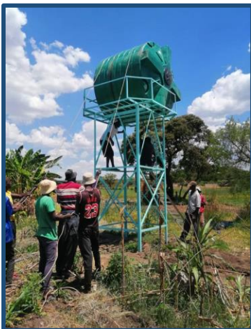
Lt. Nearly Up there!