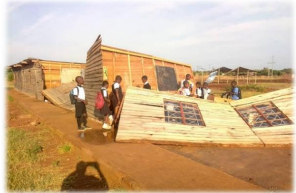
Chugutu Classrooms After Cyclone

We have used some of your donated funds for repairs and the kids and teachers are very grateful. However, there is more to do. Due to lack of funds these buildings were temporary but we didn't mean it to be for such a short time. 😊