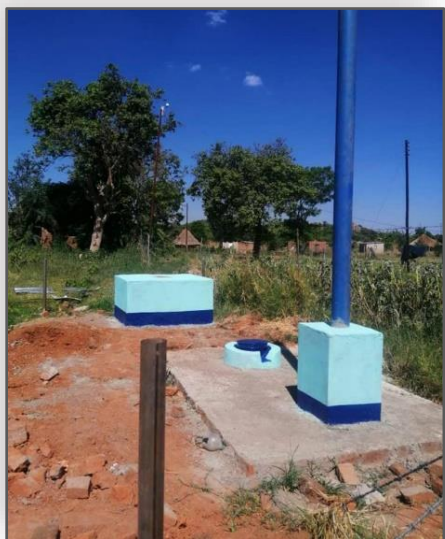
Otway Pit and Incinerator

I am really looking forward to seeing the changes made to the clinic. A while back I mentioned the clinic was operating like a hospital. We have now changed our shop into a 4-bed ward. The room needed modifications and the work is now in progress.