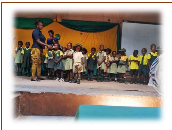
School End of Year Graduation

happened in the middle of the night (no electricity /no lights) and it was dangerous because lightning in Zimbabwe is wild. In addition to the extensive damage to the roof, all the Grade 5 curriculum books were destroyed. The building was repaired but not all the books have been replaced.