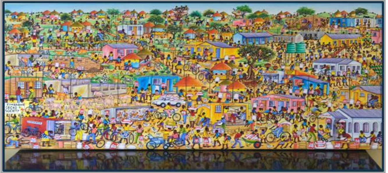
INTERPRETATION OF RASPER PROJECTS