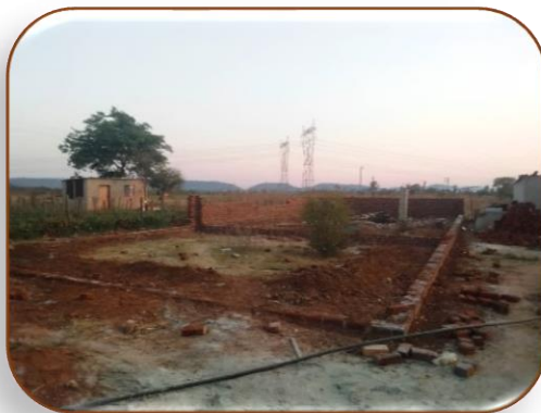
Below: Storage Shed Being Built