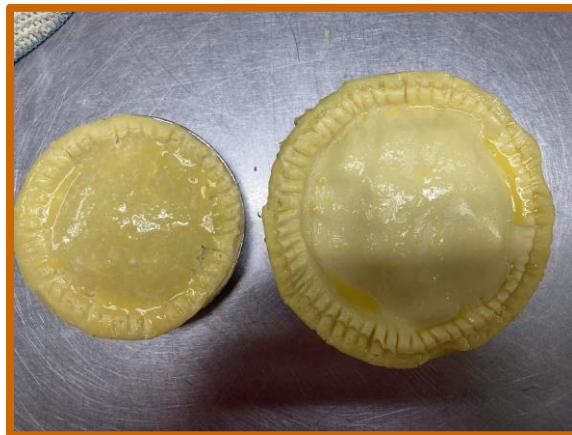
Contrasting difference in size between 4" and 5" pies